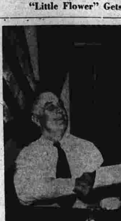
Calling at the White House to receive his commission as director of civilian defense, Mayor Piccolo of New York found President Roosevelt at work to his shirt sleeves during a heat wave at the capital. Here the president gave the "Little Flower" holding the commission, a congratulatory shake.

Merchant Ship Hit Airmen said a large merchant ship was set afire by bombs from the west coast of France in daylight operations yesterday.